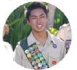
Cole from ScoutSmarts